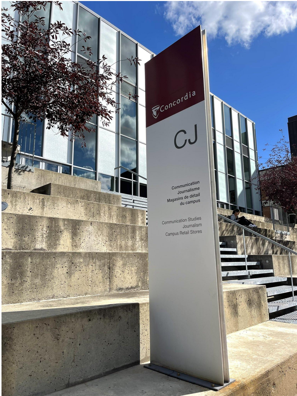
Department of Journalism Concordia University 2023-2024