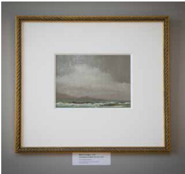
"Connemara Coast," February 2022 (oil on gesso board)