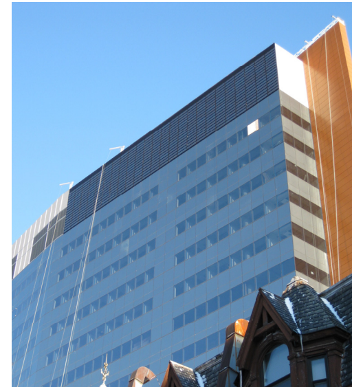
JMSB Building and the BIPVT Renewable Energy System Architecturally Integrated into the Façade