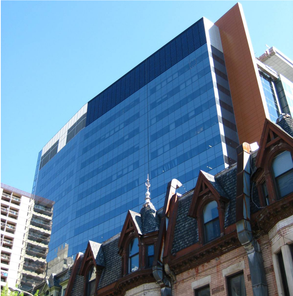
JMSB Building from street level showing the integrated BIPV/T facade

The John Molson School of Business (JMSB) building-integrated photovoltaic/thermal (BIPV/T) installation is the first of its kind – a fully integrated installation that uses a high efficiency distributed air inlet method to recover heat from the PV panels.