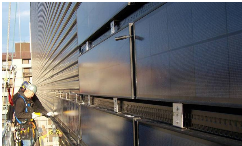
Custom PV modules being installed on the transpired solar thermal air collector

The system will be monitored by a research team at Concordia headed by Dr. Athienitis, the Scientific Director of SBRN. A monitoring room has been allocated to house monitoring equipment in the mechanical equipment floor of the JMSB building. Through monitoring of this innovative system new simulation models will be developed for its design and optimal control.