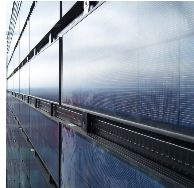
Close-up of BIPVT Façade