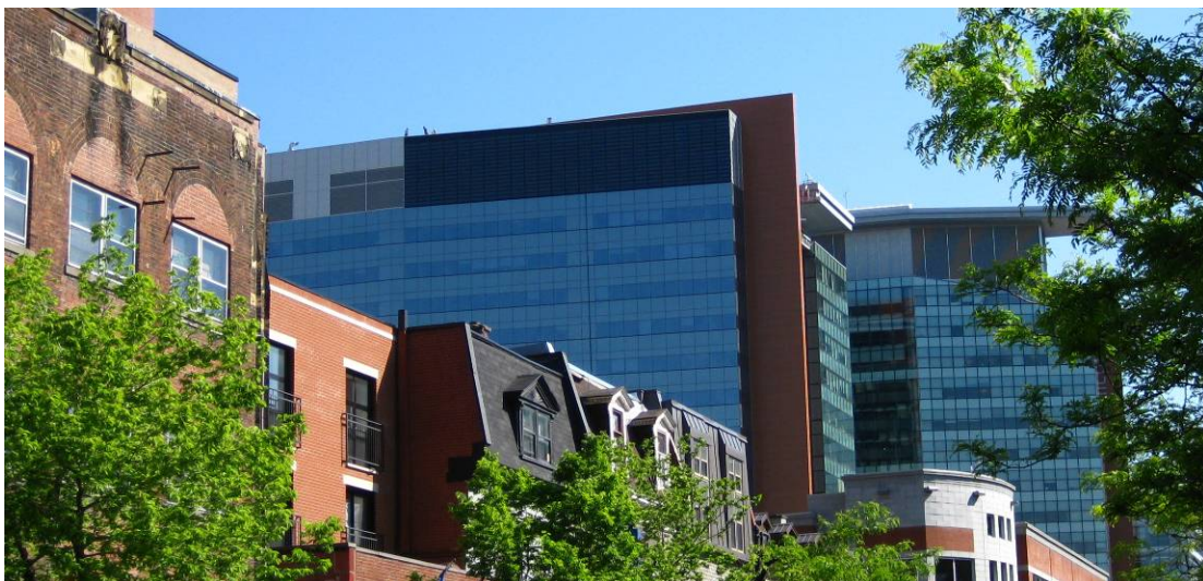
JMSB Building Solar Façade, Concordia University

The LEED® registered John Molson School of Business building will use a single façade surface to generate both heat and electricity from the sun. This type of solar installation is referred to as a Building Integrated Photovoltaic/Thermal (BIPV/T) application, and it is the first installation of its particular configuration. The combined generation is expected to have an overall efficiency of about 60% (the rate of utilization of incident solar energy).