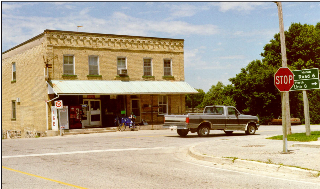
Site 17: Usborne, Ontario

Usborne, which had a population of 1,535 in 1996, is a former township now part of the Municipality of South Huron, Huron County and is dominated physically by a commercial farm landscape. Cash-crop and livestock operations had a total value $34 million in sales in 1996 and provided employment for 40% of the workforce (one of the highest shares reported in the province and in Canada). There is no town or village of any size in the township; most residents rely on the adjacent town of Exeter for service and some retail needs. Usborne's population is dispersed in farm and non-farm households.