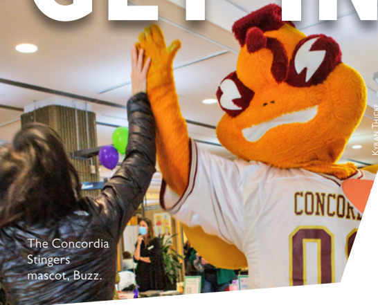
The Concordia Stingers mascot, Buzz.