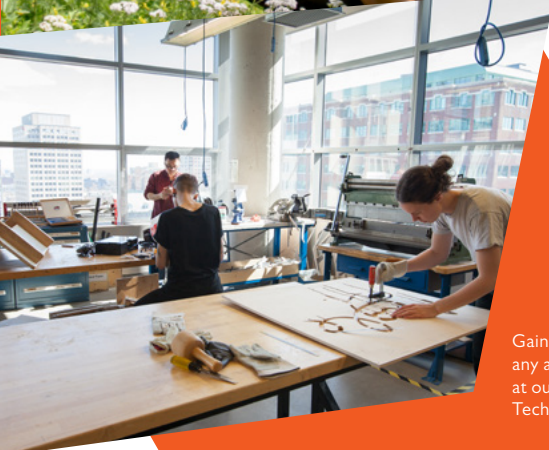
Gain the skills for any art project at our Core Technical Centre.

Learn more about the experiential learning opportunities available for students