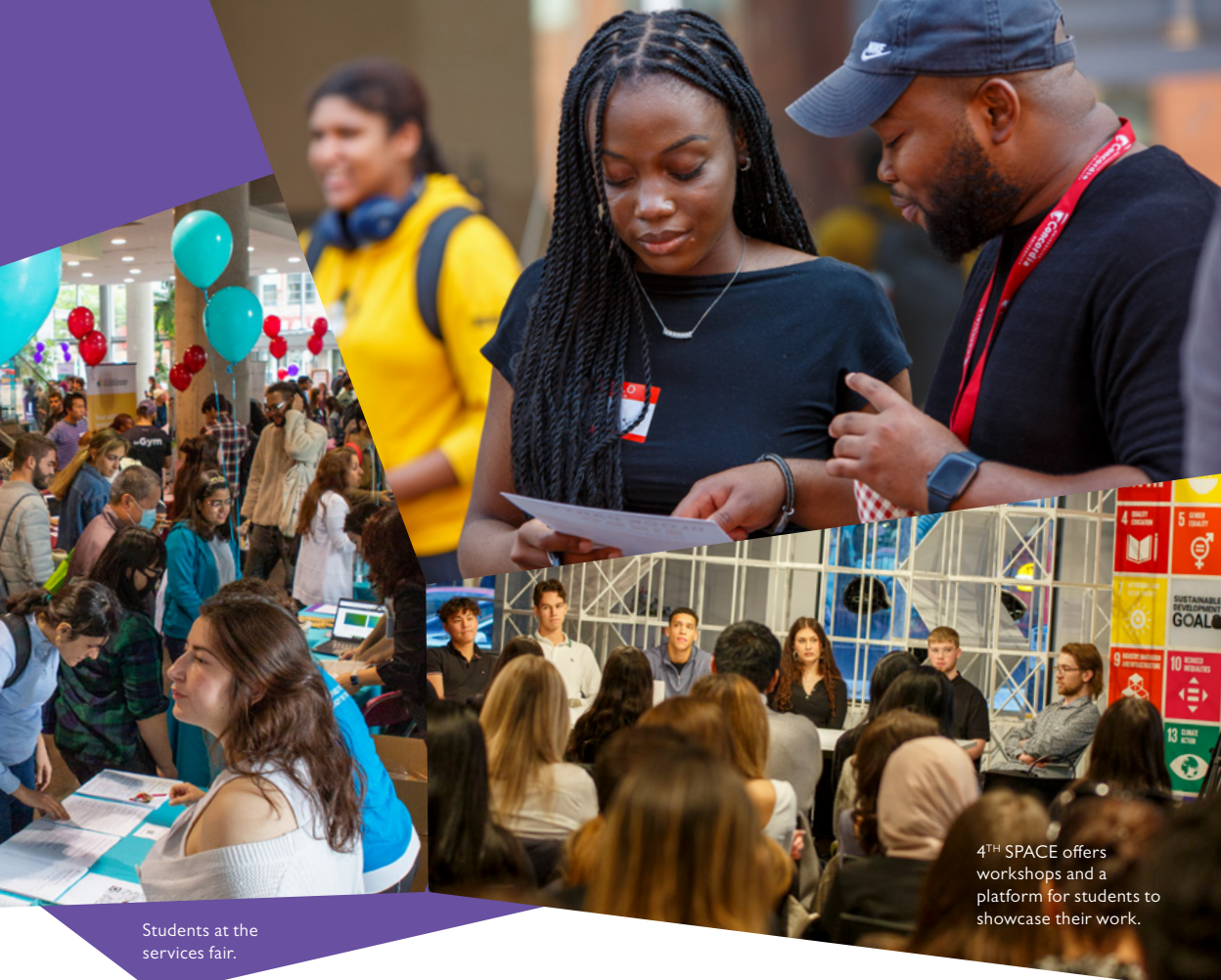
Students at the services fair.