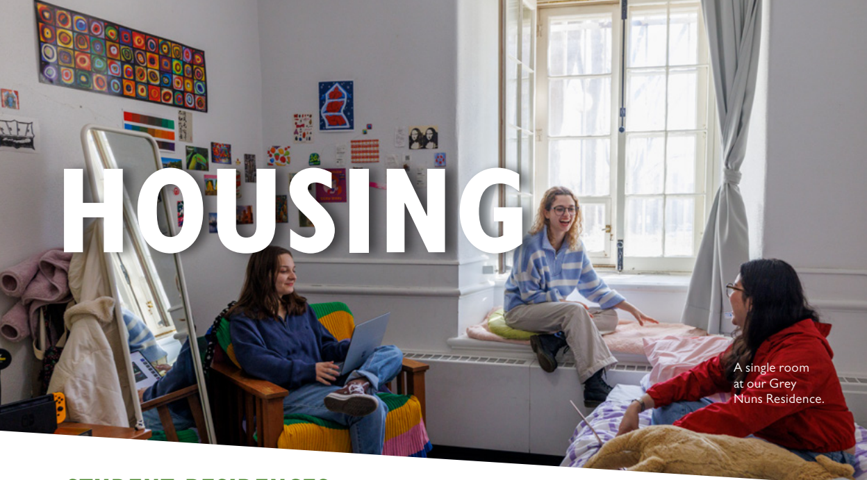
A single room at our Grey Nuns Residence.