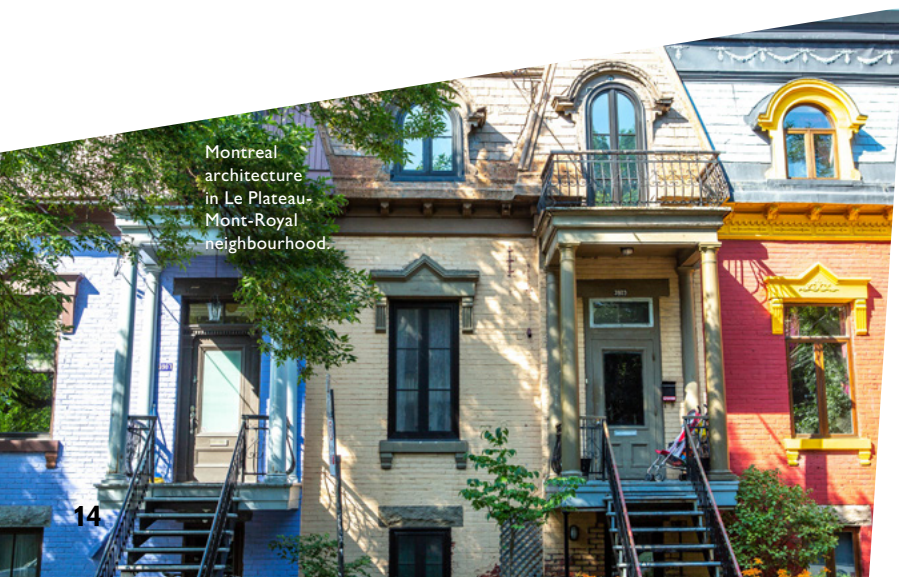
Montreal architecture in Le Plateau-Mont-Royal neighbourhood.