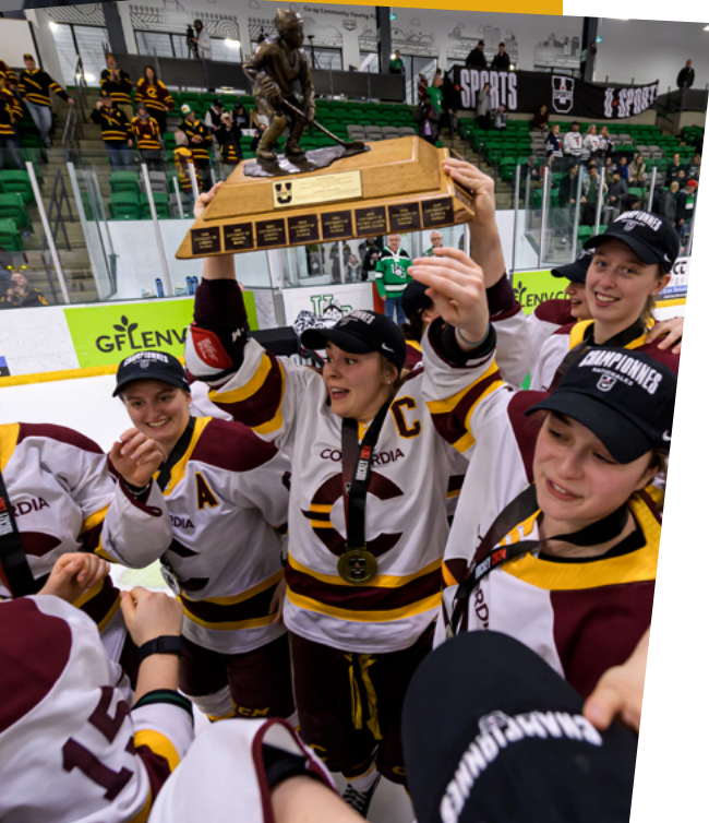
The 2023–24 U SPORTS National Champions, the Stingers Women's Hockey team.