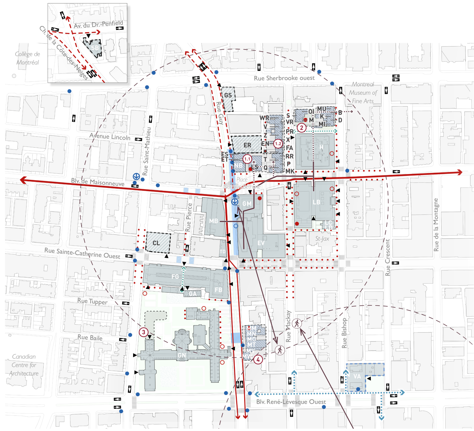
Active mobility and public transit