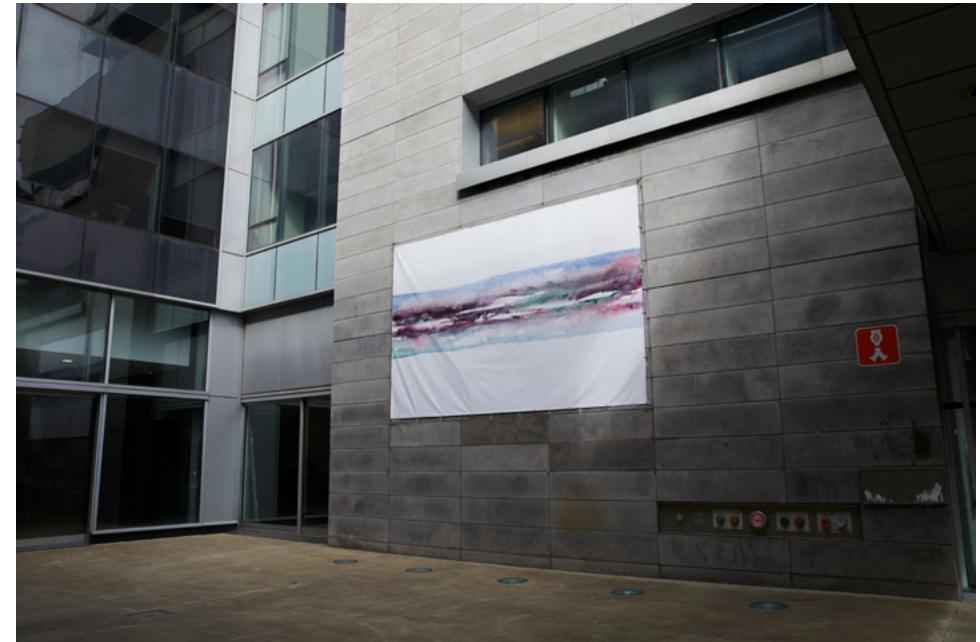
Niap, COMPOSITION . 2024. Original watercolour. 9" x 16". Vinyl banner 123" x 194".