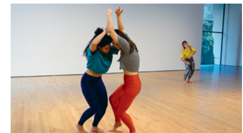
Tanya Lukin Linklater, An amplification through many minds . 2019. Single-channel projection with sound, 36:42 mins.