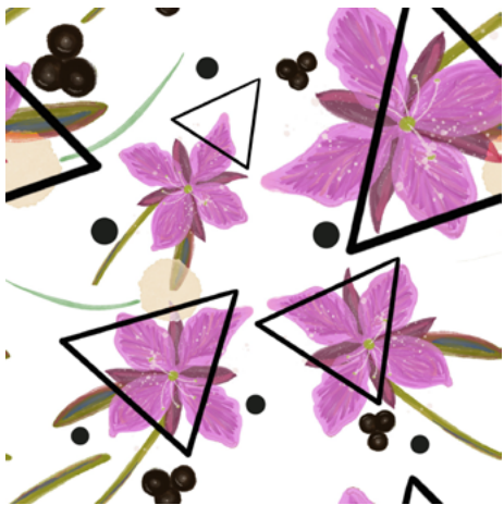
Nancy Mike, Paunnakuluit . 2024. Digital Art. 2280 x 3000px. Photo courtesy of the artist.

Fireweed is a tenacious and vibrant edible flower commonly found in many Arctic and Subarctic environments, as well as more southern climates. As such, this Arctic flora is a common sighting for Inuit who live within Inuit communities across Inuit Nunaat as well as southern Canada and other circumpolar countries.