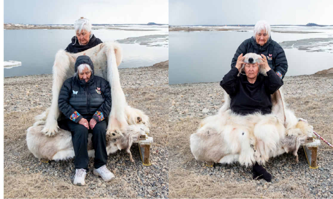
Maureen Gruben, Tadjva! Bright Like Boom . 2024. Two prints, 48" x 38" each. Archival inkjet on Canson Infinity Rag Photographique 310.

Maureen Gruben, Moving with joy across the ice while my face turns brown from the sun . 2019. 120" x 42.5". AP #2/2. Archival inkjet on Canson Infinity Rag Photographique 310. Collection of Cooper Cole Gallery, Toronto, Ontario. Installation photo from Ilagiit/Relatives .